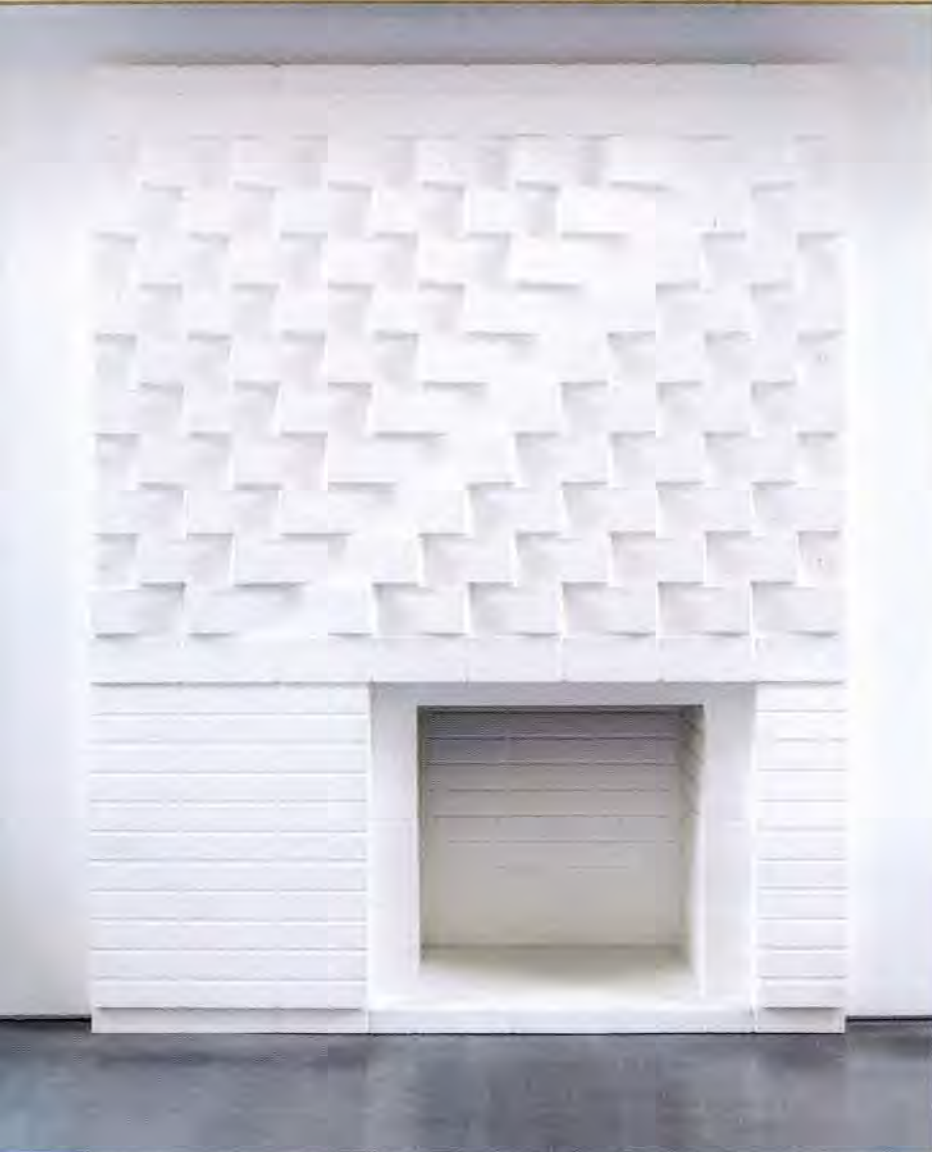
LEFT, A REPRODUCTION OF THE BRICK FIREPLACE DESIGNED BY JOSEF ALBERS FOR THE ROUSE HOUSE IN NEW HAVEN, CONNECTICUT, BUILT BY HIS ARCHITECT FRIEND AND YALE PROFESSOR KING-LUI WU