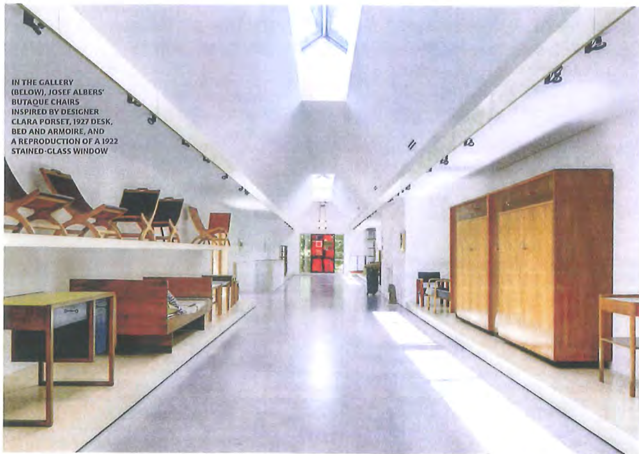
IN THE GALLERY (BELOW), JOSEF ALBERS' BUTAQUE CHAIRS INSPIRED BY DESIGNER CLARA PORSET, 1927 DESK, BED AND ARMOIRE, AND A REPRODUCTION OF A 1922 STAINED-GLASS WINDOW