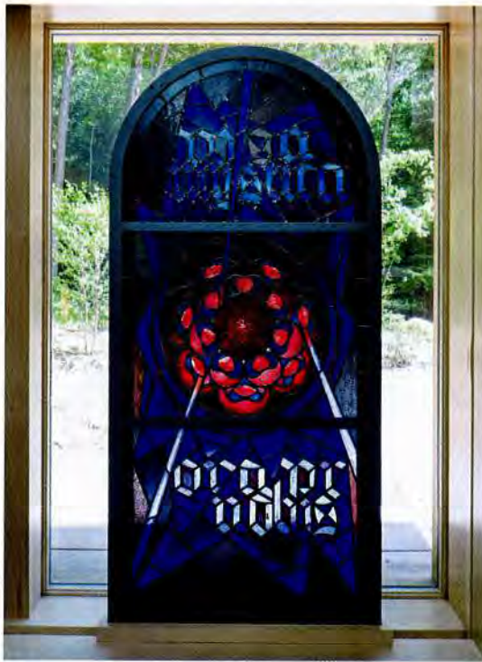
↑ A REPRODUCTION OF JOSEF ALBERS' FIRST COMMISSION, A 1918 WINDOW, SEE PAGE 135