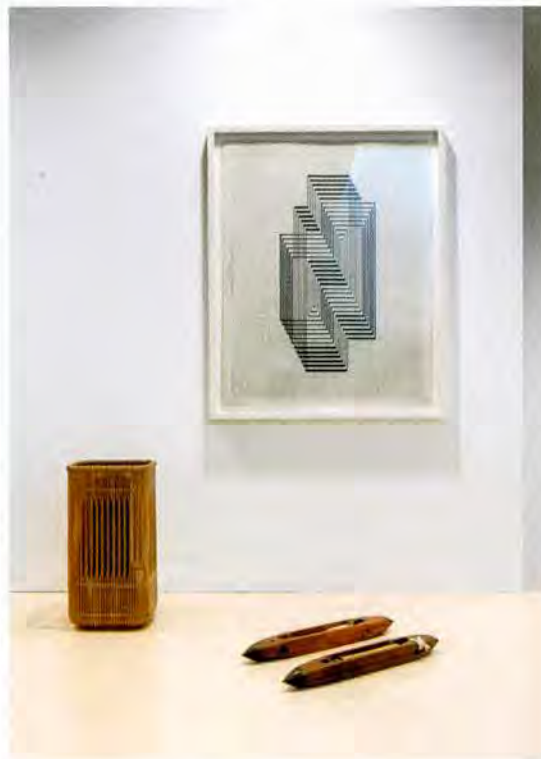
BELOW, ASCENSION , PART OF JOSEF'S 1942 GRAPHIC TECTONIC SERIES, WITH A 1950S JAPANESE VASE BY CHIKUHO, AND TWO OF ANNI'S WEAVING BOAT SHUTTLES